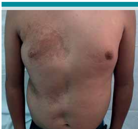
Figure 2. Patient with plaque morphea in the anterior torso, with irregular shaped plaques with dermal atrophy and visible blood vessels.

Fifty-nine patient files were located and 27 were discarded because they did not meet the criteria for inclusion. Thus, 32 patients with the diagnosis of morphea were included; females predominated, at 69% ( n = 22 ). The linear morphea subtype was the most common, at 50% ( n = 16 ) ( Figure 1 ), followed by plaque morphea at 22% ( n = 7 ) ( Figure 2 ). The median age at initial manifestations was 9 years, with a range of 1 to 16 years. Morphea lesions had characteristics of lichen sclerosus and atrophicus in 41% ( n = 16 ) of the cases; deep in 25% ( n = 8 ), and with atrophoderma in 22% ( n = 7 ). Table 1