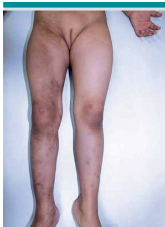
Figure 1. Patient with linear morphea in the lower right extremity, with visible sclerosis, changes of pigmentation, and mild atrophy.

Approximately 40% of children with morphea present extracutaneous manifestations: arthritis, neurological symptoms (headache, seizures), vascular disorders (Raynaud's phenomenon), ocular disorders (uveitis or episcleritis, mainly of the linear variety, in the head or en coup de sabre ) and gastrointestinal and respiratory symptoms. The association between location or type of morphea lesions in the skin and the risk of extracutaneous manifestations is unknown, as are risk factors which predispose an individual to its appearance. 7