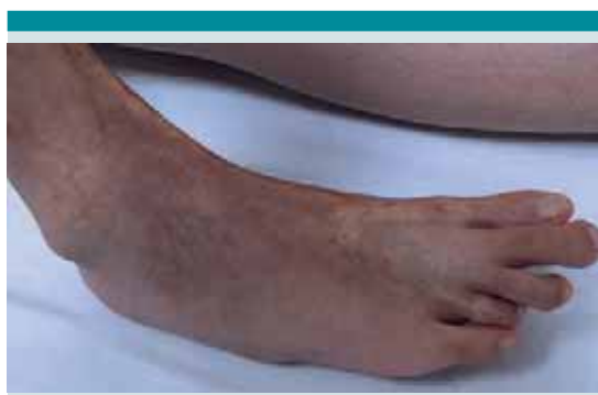
Figure 4. Sclerotic morphea plaque on the right foot, with reduction in length and joint contractures and loss of mobility in the first and fourth toes.

(34%), and joint contractures (38%) ( Figure 4 ). Only nine patients (28.1%) did not report musculoskeletal manifestations. Twenty-eight percent ( n = 9 ) of patients had neurological manifestations; the most common symptom was headache in 22% ( n = 7 ). There was no report of targeted questioning on symptoms for 6% of the patients and related paraclinical studies were not conducted for 81%. Six patients underwent neurological studies. One patient with linear morphea in the upper left extremity, with seizures underwent: nuclear magnetic resonance (NMR), computed tomography (CT) of the skull, and electroencephalogram (EEG), documenting mild cortical atrophy and epileptic activity. Another patient with linear morphea in the hemiface suffered headaches and underwent a simple CT scan which found osseous atrophy. In most patients there were no reports of ophthalmological manifestations in notes to the clinical file (78%), only three patients had clinical alterations: hemihypertrophy, strabismus, exotropia, and keratitis. Table 2